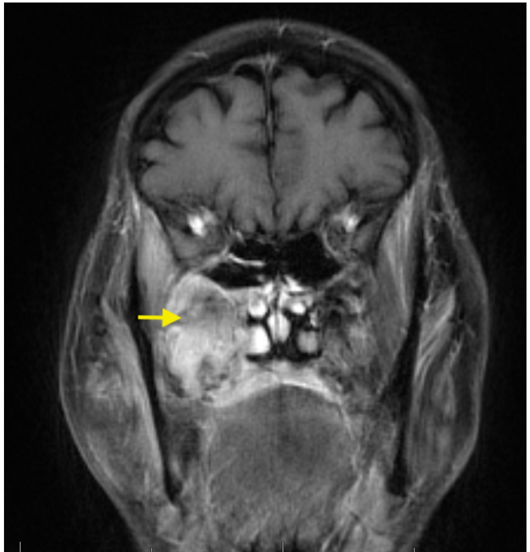
FIGURE 2: MRI of the face showing large infiltrative soft tissue lesion with extensive surrounding enhancement (DLBCL and superimposed osteomyelitis).

Surprisingly, his bone biopsy revealed an unexpected finding, as he was found to have diffuse large B-cell lymphoma affecting the same site of the osteomyelitis. Magnetic resonance imaging (MRI) of the face revealed a large infiltrative soft tissue lesion with extensive surrounding enhancement involving the right side of the face, especially the maxilla, and it was extending intracranially (Figure 2). The patient underwent staging imaging, and he was found to have stage IV DLBCL with metastasis to the liver (Figure 3). The oncology team evaluated the patient, and they recommended to start chemotherapy. Eventually, the patient was started on rituximab, cyclophosphamide, doxorubicin, vincristine, and prednisone (R-CHOP) chemotherapy. The patient completed a total of six cycles with minor complications secondary to chemotherapy such as nausea, vomiting, or anemia requiring transfusions. Fortunately, he had an excellent response to chemotherapy, and he continued to follow up with the oncology clinic.