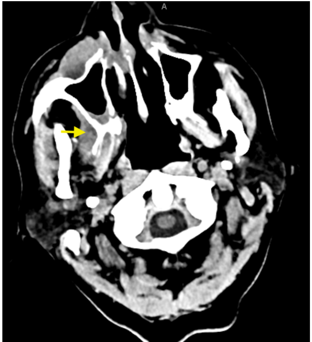
FIGURE 1: Computed tomography scan of the face showing inflammation, soft tissue swelling, and possible osteomyelitis of the maxilla.

patient endorsed night sweats and weight loss for the last two months. On physical examination, he was febrile with a temperature of 103 F, the rest of his vital signs were stable. Computed tomography (CT) scan of the face showed concerns of right maxillary osteomyelitis with soft tissue swelling (Figure 1). The patient was admitted for further workup and intravenous antibiotics.