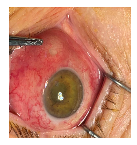
Figure 2. Endogenous hvKp endophthalmitis (EKE): corneal haze, intense hyperemia, scleral abscess in the internal angle, with impending ocular perforation.

Ocular findings included chemosis, red painful eye, haze cornea, and vitreous. Decreased visual acuity at presentation of hand movement or less and hypopyon were associated with poor prognosis [15,68,72,75–77]. Patients with unilocular involvement were found to be a risk factor for evisceration, in comparison with bilateral infection, one possible explanation being the delay in presentation in cases in which only one eye was affected [16]. In a study by Ang et al [16], early onset of the ocular symptoms was also a factor of poor prognosis, in correlation with the virulence of the pathogen and bacterial load.