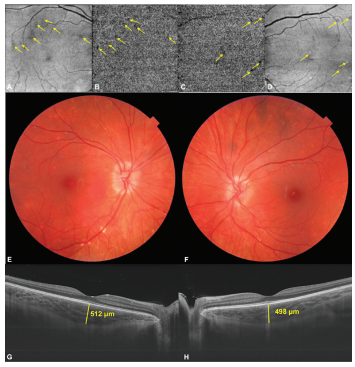
Figure 3. (A&B) Choriocapillaris slab of montage optical coherence tomography angiography and en-face OCT image of the right. (C&D) Left eyes revealing the patchy ischemia of choriocapillaris (arrows). Color fundus pictures taken at the last visit showing slightly blurred disc margins with less apparent old scars with no new lesion. (E) Right eye and (F) left eye. (G) Swept source optical coherence tomographic subfoveal choroidal thickness was 512 µm in the right eye and (H) 498 µm in the left eye.

Systemic azathioprine was prescribed four months after our initial evaluation as soon as the patient experienced the third attack of bilateral anterior uveitis.