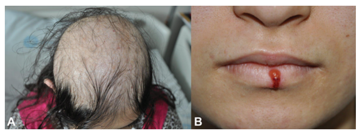
Figure 2. (A) Appearance of hair scalp from above depicting the diffuse alopecia. (B) Colored picture of coexistent Herpes Labialis.

and complement levels were normal. Furthermore, cranial and orbital MRI with contrast, chest X-ray imaging, and abdominal ultrasonography were all normal. No systemic treatment was administered as the patient had developed primary herpes labialis (Figure 2B) at the systemic evaluation phase and topical steroid treatment seemed sufficient to control the anterior chamber inflammation. In October 2018, the patient experienced a bilateral non-granulomatous anterior uveitis attack without any further posterior segment changes. Optical coherence tomography angiography and en-face OCT (Figures 3A, 3B, 3C, and 3D), as well as swept source-OCT were performed (Triton, Topcon Inc., Oakland, New Jersey, USA). This revealed that the subfoveal choroidal thickness was 512 and 498 µm in the right and left eyes, respectively (Figures 3G and 3H). At this time, oral azathioprine 50 mg daily was prescribed together with topical prednisolone acetate eye drops. This case was diagnosed as incomplete Vogt-Koyanagi-Harada (VKH) syndrome<sup>[2]</sup> without overt serous retinal detachment and a significant decrease in vision. The disease progressed to the convalescent stage of VKH syndrome (with alopecia, depigmentation of fundus, and peri-papillary atrophy) as no systemic treatment was given early in the course of the disease.