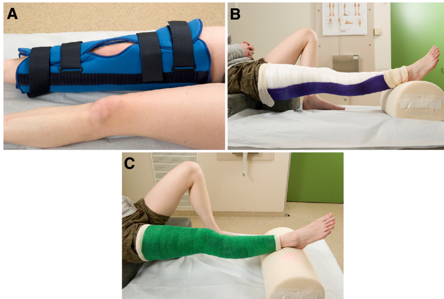
Figure 1 Conservative treatment in acute primary patella dislocation. A: brace. B: posterior splint. C: cylinder cast. Published with permission of the patient.

and a knee brace in patients with primary acute patellar dislocations. These inclusion criteria were used to make a selection based on the title and/or abstracts. Animal studies, case reports with fewer than five cases and studies on patellar fractures were excluded from the review. Independently and in duplicate, two of the authors performed a more thorough selection using the aforementioned exclusion criteria. Bibliographies of all the selected articles were reviewed for additional articles (Figure 2). The primary objectives were to compare redislocation rates and joint movement restrictions after treatment with cylinder casts, posterior splints and knee braces. Secondary objectives were to compare redislocation rates after surgery and conservative treatment. Results were expressed as relative risks (RR) with 95% confidence intervals (CI95%) or p values.