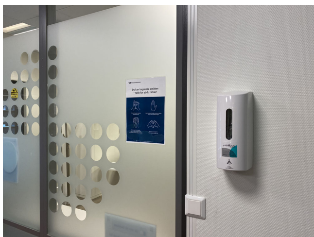
FIGURE 4 Easily accessible hand sanitizer is placed at the entrance to an aesthetic clinic, along with clear signage (both written and visual) instructing patients to disinfect their hands before entry and after leaving the clinic. Automatic doors in this clinic allow for contactless entry. Where this is not possible, it is preferable for an entrance door to be secured in the open position to avoid unnecessary contact with door handles.