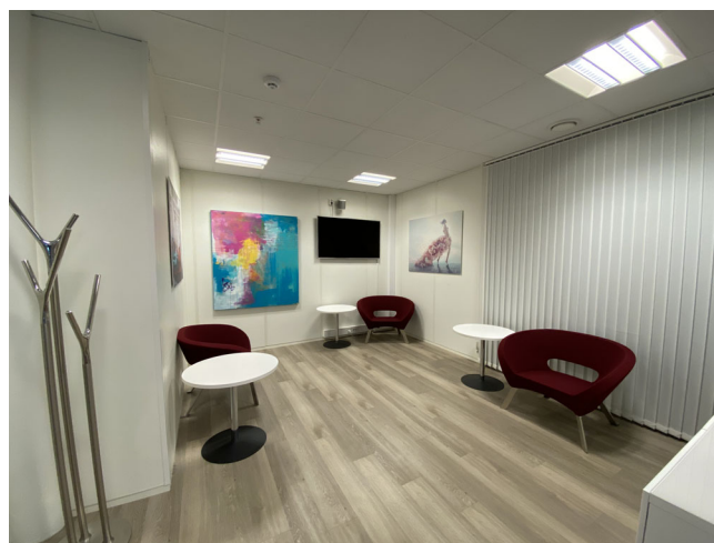
FIGURE 5 A waiting area within an aesthetic clinic, where seats are placed 2 m apart to maintain social distancing. Local regulations may stipulate the total number of occupants per m 2 . All loose items such as magazines and information leaflets have been removed to reduce the risk of asymptomatic viral spread through shared contact.

possible should be facilitated, depending on the design of the clinic. A fan may be placed to change the direction of the flow of air away from the treating physician/therapist. 38 Hospitals/clinics may look into adding HEPA filters at more places in their existing HVAC systems. A low-cost air purifier with a HEPA filter can cost approx. $100 and circulates the air in a 155 sq. ft room five times per hour, and these could be deployed widely in hospital/clinic environments. 39