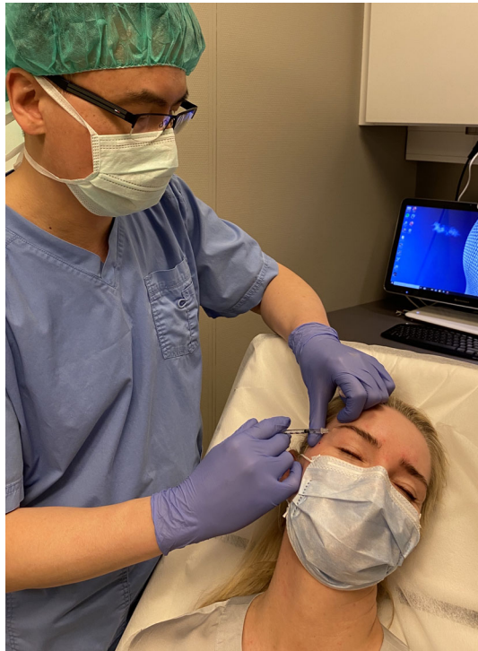
FIGURE 2 An Aesthetic Practitioner performs an upper face botulinum toxin injection wearing a standard 3-ply surgical mask, eye protection, gloves, and a surgical cap. This is appropriate personal protective equipment as per the consensus recommendations for a “low-risk” procedure. In this instance, as the treatment area is the upper face, the patient is also able to wear a face mask

The consensus was that the older staff members (>60 years) or those with associated comorbidities like diabetes, pulmonary conditions, cardiac conditions should be given leave or given work in areas with limited patient contact. 28 Staff can be posted for shorter working hours than usual and should be called in rotation. 29 At any given time, 33% to 50% of staff should be working at the clinic. 30 Staff must get training in donning and doffing of personal protective equipment and should be