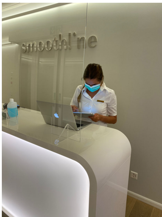
FIGURE 3 An aesthetic clinic receptionist wearing the recommended standard 3-ply surgical mask, is separated from patients by a transparent acrylic splash screen for additional protection. Hand sanitizer is available for regular and frequent use by the staff member before and after any physical interaction with patients. Contactless payment by card is the preferred transaction method.