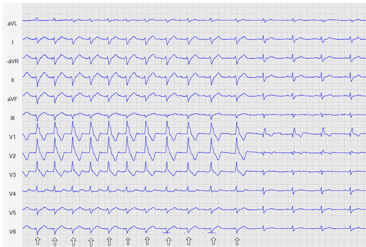
FIGURE 2 ECG during exercise test after implantation showing atrial sensed ventricular pacing with an atypical RBBB configuration of the stimulated QRS complex (arrows show ventricular pacing; the rest were without ventricular pacing) [Color figure can be viewed at wileyonlinelibrary.com ]