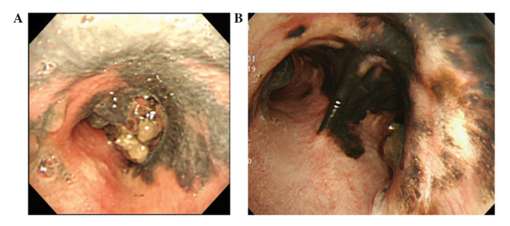
Figure 2. Endoscopic findings. (A) Prior to treatment, bronchoscopy revealed a pigmented, cauliflower-like, warty tumor. (B) Following chemoradiotherapy, bronchoscopy revealed darkened regions in the tracheal mucosa.