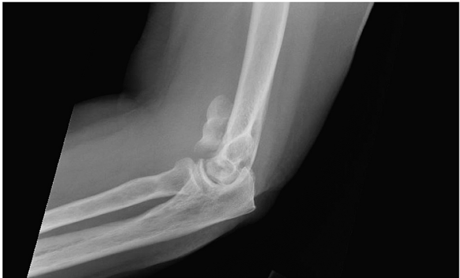
FIGURE 1: Comminuted intra-articular distal humerus fracture of the left upper extremity.

The patient's medical history included heart failure with reduced ejection fraction (HFrEF), hypertension, type 2 diabetes, anxiety, and acid reflux. She was on aspirin, atorvastatin, lisinopril, metoprolol, torsemide, empagliflozin, insulin, metformin, gabapentin, sertraline, and pantoprazole. During the clinical interview, the patient reported feeling weak. Her admission lab results are presented in Table 1.