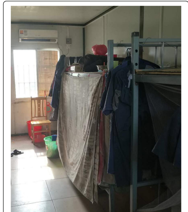
Fig. 2 The house where we collected the two adult triatomine bugs

The two bugs were identified to be heterosexual and showed morphological characteristics of T. rubrofasciata (Fig. 3). The female and male were approximately 25