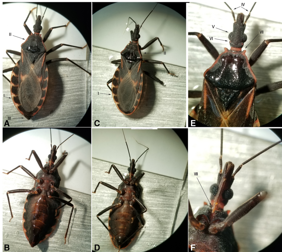
Fig. 3 a and b Dorsal and ventral views of the female T. rubrofasciata ; c and d Dorsal and ventral views of the male T. rubrofasciata . I: Orange-red margin along the outer edge of the abdomen which extended horizontally between segments; II: Orange-red margin along the side of the pronotum; III: The genital region of the female adult bug was strongly projecting posteriad; IV: The first segment surpassed the apex of its head; V: Eyes at the sides of a long and cone-shaped head; VI: Ocelli; VII: Anterior angles produced into short spines of a reddish yellow color; VIII: The stout proboscis hinged beneath the thorax, covered with short hairs which were progressively longer towards tip

same. These fragments showed more than 98% identity with the genes of T. rubrofasciata identified and sequenced in other areas such as Taiwan of China, Vietnam and Brazil.