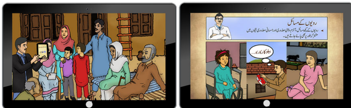
Fig. 2. Avatar-Assisted Cascade Training (ACT).

The champion family volunteers will be supervised by the trainers, who will be supervised by the master trainers on monthly basis. The fidelity of program delivery will be established by the master trainers by