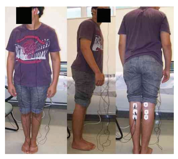
Figure 1 Electrode positioning and subject's posture during examination.

The analysis of the EMG responses was based on the lower limb contralateral to head rotation. The tracings obtained from the two configurations of electrode placement were superimposed after digital filtering and subtraction of the pre-stimulus EMG rectified mean. The responses that reversed polarity after stimulation for both polarity conditions (LCRA and RCLA) were considered to be of vestibular origin.<sup>2-4</sup> The two components (SL and ML) of the vestibular evoked reflex were defined. A response starting between 40 and 70 ms, which was reversed by inverting the polarity of the stimulus, was considered as the SL component; the ML component had opposite polarity to the SL component, beginning at approximately 100 ms after the stimulus (Fig. 2).