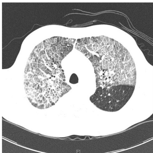
Fig. 2. Chest CT. Diffuse ground glass pattern consistent with pulmonary haemorrhage and sparing the left lower lobe.

Oral cyclophosphamide was started (2 mg/kg/day) with a further 3 days of IV methylprednisolone. Blood transfusion was given and intermittent haemodialysis was continued.