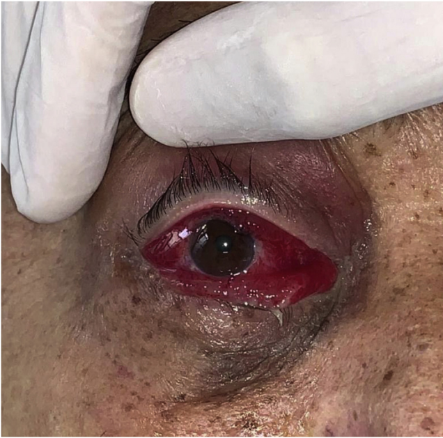
Figure 1 Erythema and severe swelling of the conjunctiva associated with upper eyelid erythema. Rhino-orbito-cerebral mucormycosis.

apy, and respiratory physical therapy. He was discharged from this hospital and immediately sought the service with edema and intense erythema on the right conjunctiva, mild erythema on the upper eyelid (Fig. 1), and ocular plegia on dynamic examination. Complementary tests showed DM decompensation, and a computed tomography showed inflammatory sinus disease. With the diagnostic hypothesis of rhino-orbito-cerebral mucormycosis, a surgical approach was performed, and the material was sent for histological examination, which showed coenocytic hyaline hyphae with a 90° angle (Fig. 2), and for fungal culture, which