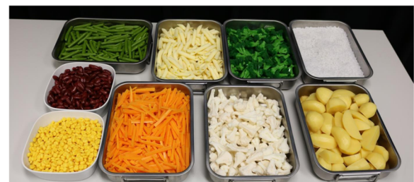
Fig. 1 Replica foods used in experiment. Clockwise from the top left: green beans, pasta ( penne ), broccoli, rice, potatoes, cauliflower, carrots, sweetcorn, and kidney ( red ) beans

To test the impact of ServAR on serving accuracy for the purpose of this proof-of-concept study, a reference serve for