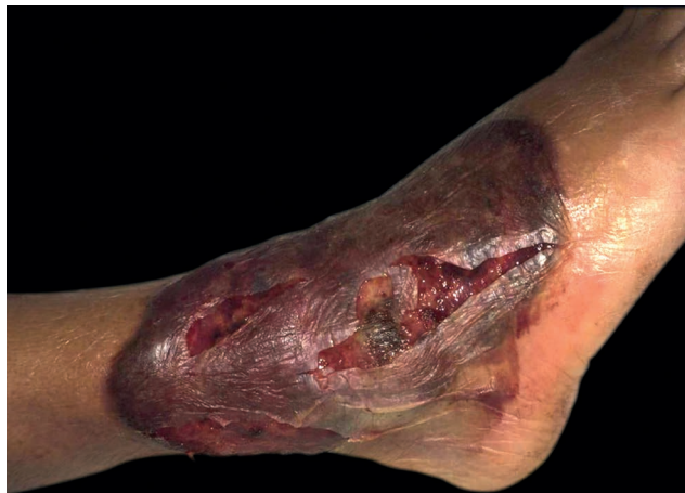
FIGURE 2: 15 x 12cm, oval erythematous plaque, above which there was a large hemorrhagic bulla. The lesion was very painful and it was located on the lower third of the right leg

PG is a necrotizing neutrophilic dermatosis which belongs