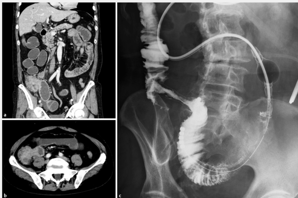
► Fig. 1 Images of Patient 1. a, b Contrast-enhanced computed tomography scan reveals thickened ileocecal stenosis with proximal dilation of the colon and distal small intestine. c Contrast medium was injected from the decompression tube, revealing the stenosis and terminal ileum clearly.

passed over the 0.025-inch guidewire (Visiglide, Olympus). Inserting the catheter into the ileocecal valve is difficult because of its angled anatomy. In such situations, we passed the stricture with the ERCP catheter with a movable tip (Swing Tip Canula, Olympus). Subsequently, the contrast medium was injected