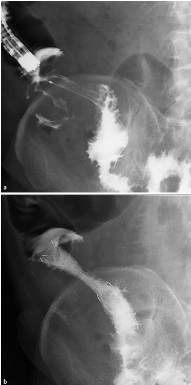
► Fig. 3 Images of Patient 4. a Under endoscopic and fluoroscopic guidance, the contrast medium is injected through the catheter to define the degree, length, and site of the stricture. b The self-expandable metallic stent is placed with fluoroscopic guidance.

We performed enema for preparation and washed away feces to maintain a clear endoscopic view during insertion (if possible, use of a water jet is desirable), and the scope was able to reach the ileocecal region. We successfully passed the ileocecal obstruction by using the ERCP catheter with a movable tip. When the decompression tube was deployed before stenting, contrast medium injection from the decompression tube was effective for assessing the oral side of the intestinal tract and useful for seeking the guidewire. In 1 case, selecting the oral side by the guidewire was difficult. Because the tumor was too