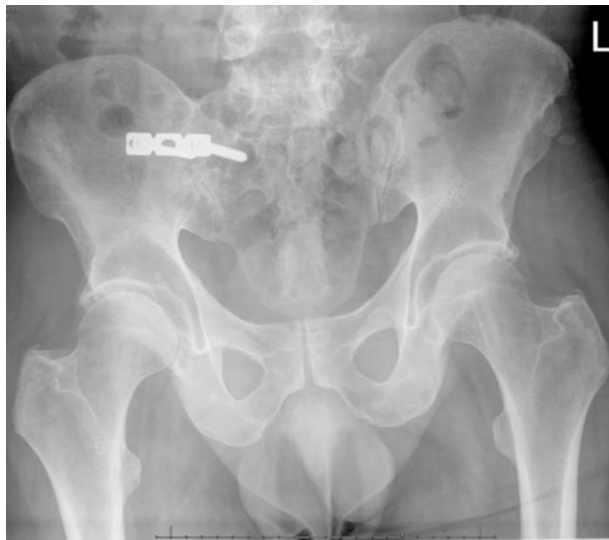
Figure 1 Postoperative radiograph of a pelvis with a three-hole reconstruction plate spanning the sacroiliac joint.

Note: The 'L' represents the patient's left.