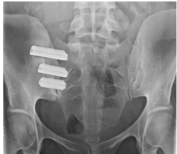
Figure 2 Postoperative radiograph demonstrating placement of three fusion implants across the sacroiliac joint.

Patients were instructed to ambulate with the assistance of a walker for the first 4 weeks, after which time toe-touch ambulation was recommended for a further 4 weeks.