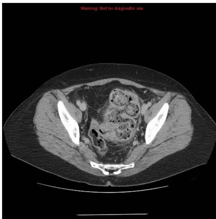
Fig. 1. Image depicting large fecal load, sigmoid wall thickening and extensive peri-colonic infiltrative change.

Stercoral perforation of the colon was initially described by Berry in 1894 (9). Fewer than 90 cases were reported by the year 2000 (1). However, it was the cause of 3.2% of colonic perforations in one series (1) and present in 2.2% of randomly selected autopsy examinations (10). Cases of stercoral perforation of the colon are likely both under-reported and are often not recognized. With an aging population and an increase in life expectancy, there are many people who survive with debilitating conditions. Sick elderly people, bed bound or minimally active, who are on multiple medications that affect bowel motility are prone to