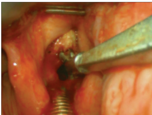
Figure 2: Biopsy of laryngeal lesion was taken with videolaryngoscope while LASER endotracheal tube in place

procedures in the presence of unfavorable anatomy and high-risk neck extension or damage to oral structures.