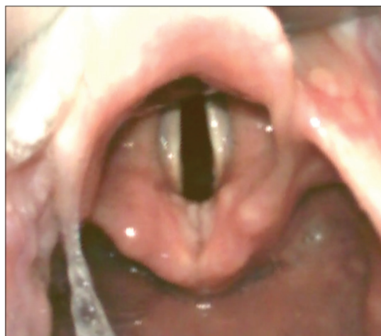
Figure 1: Normal videolaryngoscopic view of glottis with other surrounding structures

Video-augmented periglottic visualization allows the adaptation of VL for airway procedures well-beyond intubation and a variety of ingenious applications and uses. [2] According to the current scientific literature, VL has been used for examination and biopsies of the tongue base, removal of foreign bodies, and radiofrequency treatment of obstructive sleep apnea. [3] It is sometimes happened for the ear-nose-throat (ENT) specialist to experience technical issues due to the misplacement of the direct laryngoscope because of some particular anatomical or pathological features (i.e., traumatic injuries, cervical spine immobilization, etc.). [3] The use of VL can help in managing these issues and facilitate the execution of several procedures in addition to simple endotracheal tube placement. [4] We are sharing our experience of one such case where VL helped in achieving an optimal view and obtaining biopsy, thus providing greater ease for surgical team.