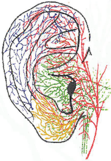
FIGURE 1: The innervations of the external auricle. The innervations of the auricular branch of the vagus nerve are marked by green color. The innervations of the auriculotemporal nerve are marked by red color. The innervations of the lesser occipital nerve are marked by blue color. The innervations of the greater auricular nerve are marked by yellow color.

and depressor response, induced by stimulations including cerumen crumming in auditory canal or auricular concha [23, 24]. Engel [25] groups together eight reflexes including gastroauricular phenomenon in man, auricular phenomenon in man, pulmoauricular phenomenon in man, auriculogenital reflex in cat, auriculouterine reflex in women, oculocardiac reflex in man, Kalchschmidt's reflex in cattle, and coughing attack with heartburn in man. According to the national standards of the location of auricular acupoints [26], auricular acupoints treating visceral diseases are mainly located at auricular concha (see Figure 2). Perhaps the ABVN forms a connection between the auricle and the autonomic regulations.