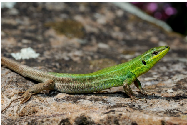
FIGURE 1 Organism photograph: The endemic island lizard Podarcis waglerianus (Cefalù, Sicily).

The matrix of pairwise phylogenetic distances was used to calculate the phylogenetic species variability (PSV) and phylogenetic species clustering (PSC) (Helmus, Bland, Williams, & Ives, 2007). PSV is statistically independent of species richness and measures the mean relatedness among all the species composing an assemblage (Helmus et al., 2007). PSC measures the phylogenetic distance between the nearest relatives within an assemblage. Both metrics tend to a value approaching zero when the species are phylogenetically close and to a value of one if they are not closely related (Helmus et al., 2007). These metrics were calculated using the picante package (Kembel et al., 2010) in the R environment (R Core Development Team, 2019).