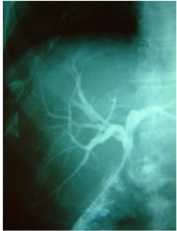
Figure 4. Postoperative Cholangiogram Performed Through the Trans-Jejunal Hepatic Duct Stent Showing Integrity of Anastomosis

case of poor outcome or failure was noted. There was no correlation between injury class and outcome ( P = 0.740 ). Three patients failed to appear at preset dates and were followed up for less than six months; however, all of these three patients had excellent outcomes in their last visit. One of our patients showed mild abnormality in liver enzymes in the first three months yet the liver enzymes reached normal levels (excellent outcome) in long-term follow-up. For patients who were followed-up for at least four years (19 patients), all had excellent outcomes.