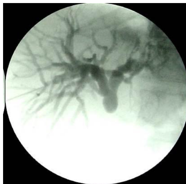
Figure 2. Preoperative Percutaneous Transhepatic Cholangiography (PTC) Showing Biliary Duct Ligations Following Previous Laparoscopic Cholecystectomy

biloma. For all patients an abdominal ultrasound was performed. endoscopic retrograde cholangiopancreatography (ERCP) and magnetic resonance cholangiography (MRC) were also performed in 14 (63.6%) and 12 (54.5%) patients, respectively. One patient underwent Percutaneous Trans-hepatic Cholangiography (PTC). None of the patients had ultrasonographic evidence of cirrhosis (ascites, splenomegaly and characteristic hepatic parenchymal echo pattern) before reconstruction. ( Figures 2 and 3 ) Abnormal liver enzymes were detected in 12 cases (54.5%) in their pre-operation visit. The mean serum total and direct bilirubin levels were 12.26 (range: 0.3 - 27.8) and 8.00 (range: 0.2 - 19) mg/dL, respectively. The mean level of serum alkaline phosphatase was 898.16 (range: 210 - 1940) IU/dL.