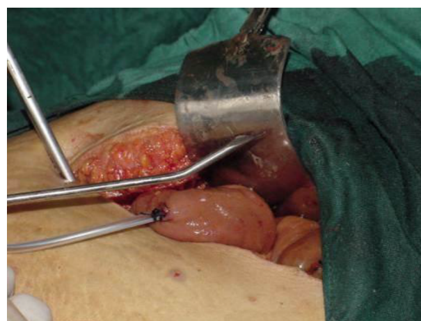
Figure 1. Intraoperative Placement of a 6F Drain Within the Hepatic Duct and Exit Site From the Jejunal Lumen

sorbable suture materials. The length of the limb was between 50 and 70 cm, and the distance from the ligament of Treitz was around 20 - 30 cm. Before completion of the anastomosis an access loop was constructed: a 6F plastic Drain (hemovac) was cut bifurcated at its distal end, longitudinally for about 3 - 5 cm, and each limb was inserted into the left and right orifices. Next, the drain was passed through the lumen of the jejunal limb for about 15 - 25 cm and brought out of the bowel with a silk purse-string suture (Figure 1). The exit site of the drain from the bowel was sutured to the entrance site of the drain into abdominal wall with two silk sutures. Another drain was placed routinely in the sub-hepatic space adjacent to the anastomosis. It should be mentioned that the distal portion of the common bile duct or common hepatic duct was not ligated, even in cases for which ligation was possible.