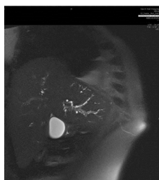
Figure 2 Magnetic resonance cholangiopancreatography image showing 'beading' effect of intrahepatic bile ducts.

The patient underwent two ERCP procedures; on the first occasion, endoscopic sphincterotomy and balloon trawl of sludge were performed. His bilirubin peaked at 241 \mu\text{mol/L} just before this procedure and slowly fell during subsequent weeks. A trial of ursodeoxycholic acid was also initiated after the first procedure. A further ERCP and balloon trawl of sludge with bile taken for