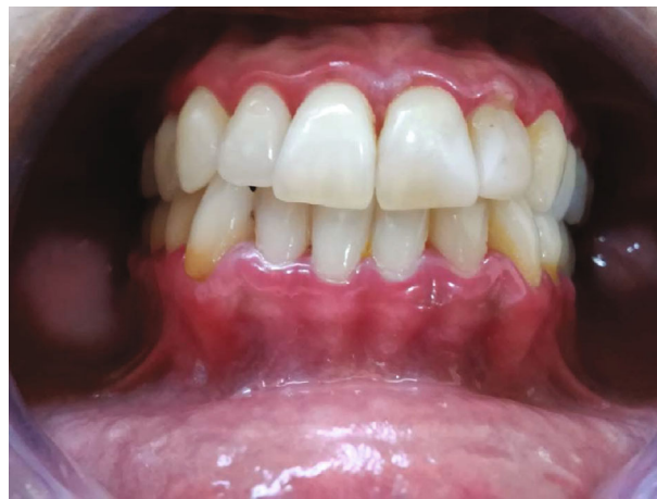
FIGURE 5: Improvement without signs of bleeding after 3 months. Photograph of intraoral aspect in the last follow-up consultation.

As for BMMP and its clinical signs, some studies have shown that desquamative gingivitis can be present in up to 95% of cases [5, 11, 12]. Erosive flat lichen and, less frequently, pemphigus vulgaris may also cause desquamative gingivitis [5]. Periodontists have a key role in diagnosing, preventing, and treating complications of these conditions [4]. The changes caused by BMMP in the oral epithelium affect periodontal health, facilitating the accumulation of dental biofilm and changing periodontal parameters. Bleeding, probing depth, and the clinical insertion level may make diagnosing the condition challenging due to the overlapping