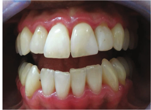
FIGURE 3: Follow-up after prednisone treatment. Intraoral image 40 days after the beginning of treatment, showing erythematous gingiva.

for this chronic and inflammatory mucous membrane group of diseases. Therefore, this report is aimed at describing the case of a 51-year-old female patient, who presented with clinical desquamative gingivitis and was initially diagnosed and treated as NPD.