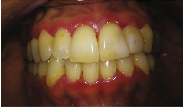
FIGURE 1: Initial characteristic of the gingiva with an erythematous aspect and with sulcus suppuration. Intraoral image of the patient at the initial examination.