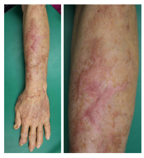
Fig. 3. After 3 months of follow-up. The lesions improved with postinflammatory hyperpigmentation and scar.

patient developed as cellulitis and did not improve with empirical antibiotic treatments. Cutaneous lesions not successfully treated by antibiotics require additional tests to determine whether it is a fungal or mycobacterial infection. In addition, if cryptococcocus is identified by biopsy or culture, other investigations such as chest radiography, thorax CT, serologic tests for HIV, tests of CSF, and blood and urine cultures should be performed to rule out systemic infection, as skin lesions are markers of systemic cryptococcosis.<sup>4)</sup>