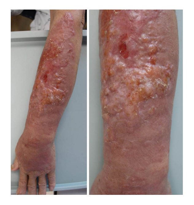
Fig. 1. Erythematous plaque with ulcers and oozing on left forearm.

examinations for evaluation of systemic cryptococcosis. The patient was treated with intravenous fluconazole at doses of 400 mg/day for 4 days and 200 mg/day for 10 days. Two weeks later, several cream-colored smooth colonies were observed in cultures, which