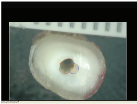
FIGURE 3: AutoCAD imagery showing the prepared canal (in red) and the unprepared canal (in blue).

At the coronal third level, first we tested the reasonableness of the data by applying a Shapiro-Wilk test, which produced a p value of 0.1325, thus confirming the data for coronal section were normal. Consequently, we applied ANOVA analysis to test the mean difference between the various types of instruments. The p value obtained with the ANOVA analysis was 5.78 \times 10^{-8} , which leads us to conclude that there are significant differences between various types of instruments. In order to see exactly where those significant differences between groups lie, we carried out pair matching tests. As the data was normal, we performed a t -test on each pair of types of instrument, which revealed that the mean results with Wave One were significantly different from the rest ( p < 0.05 ) (Table 1).