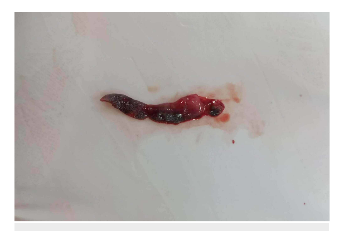
FIGURE 2: Gross biopsied specimen

The pigmented area was smooth, non-tender with irregular margins involving free and attached gingiva. The patient denied any cutaneous pigmentary changes, foods, or dental hygiene agents that had caused any oral irritation, usage of tobacco products, and awareness of oral habits of compulsion. The widespread nature and clinical appearance of the lesion were perplexing for the authors, thereby necessitating an incisional biopsy. The area to be biopsied was the edentulous region (46). The gross specimen comprised an irregular, blackish-brown soft tissue measuring 1.5 \times 0.6 \times 0.2 cm in size (Figure 2).