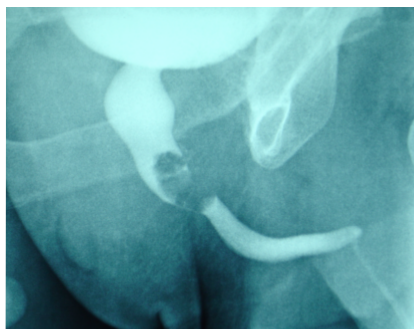
Figure 1. Intravenous urogram showing the tumor invading the prostatic urethra as a contrast-defective oval mass within the lumen.

Microscopically, the histological specimens taken after both TURs showed a uniform proliferation of spindle and ovoid stromal cells, some of which had atypical nuclei, scattered mitotic figures, and necrotic foci. A malignant stromal tumor of the prostate was diagnosed. After RP, the cut surface of the prostate showed a gray-white polypoid mass protruding into the urethral lumen with numerous hemorrhagic foci (Figure 2), and histological examination revealed a highly malignant mesenchymal neoplasm with multiple areas of necrosis, high mitotic count, and nuclear atypia (Figure 3A). The spindle cell component was intercalated by dilated epithelial structures reminiscent of a malignant phyllode tumor (Figure 3B), and there were tumoral vessels permeating the capsule and pericapsular tissue (Figure 3C). Immunohistochemistry findings showed that the tumoral cells were reactive for vimentin (Figure 3D), progesterone receptor (scattered cells), and CD34. The margins were free, in close proximity to foci of the tumor in periprostatic soft tissue. The final histopathological diagnosis was high-grade prostatic specialized stromal sarcoma.