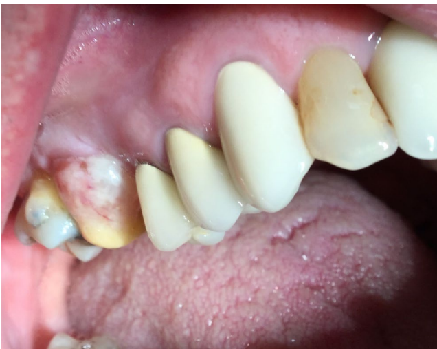
FIGURE 2 After four postoperative weeks, the patient complained of a yellow protrusion that he was able to push back into the socket but would not stay in place