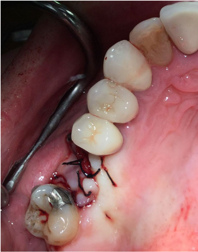
FIGURE 4 A buccal fat pad pedicle flap was made and primarily closed with 3-0 black silk suture