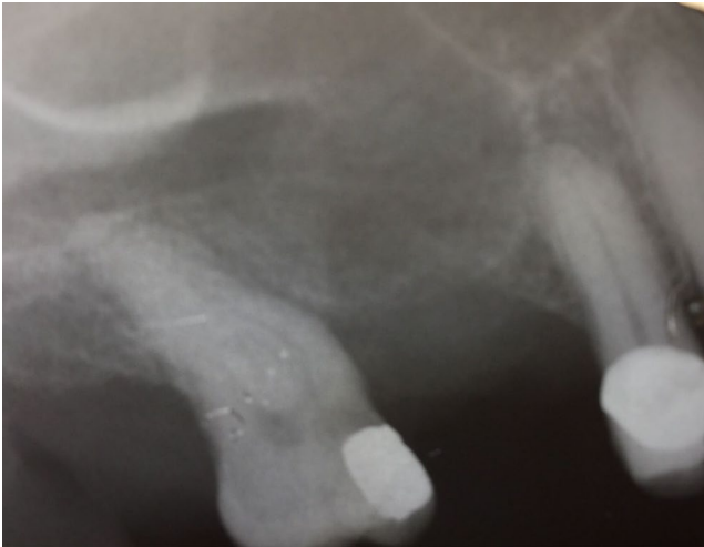
FIGURE 5 Radiograph of the treated site

Caries was subsequently treated, and the patient prescribed a fluoridated oral daily rinse (0.2% neutral sodium fluoride, Preident Rinse, Colgate).