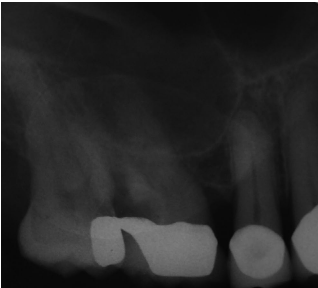
FIGURE 1 Preoperative radiograph of the unresterable maxillary right first molar tooth

The patient returned in 10 days for suture removal. There was no pain, signs of infection, or oral-antral communication.