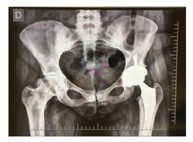
Fig. 3 Demonstrative photograph of residual dysmetria in postoperative malleolar evaluation.

Gluteus maximus tenotomy is described for the treatment of deep gluteal pain, which can result from non-discogenic compression (sciatic nerve compression).<sup>5</sup> The description of this procedure as a protective measure against sciatic nerve injury during THA (as presented by the authors) requires studies with greater scientific evidence. Nevertheless, the electro-neurophysiological results presented here support us to stimulate large centers in performing prospective clinical studies to ratify these results.