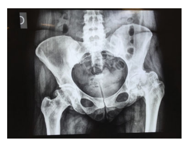
Fig. 1 Posterior-anterior hip radiography—bilateral coxarthrosis and lower left limb shortening.

The patient was submitted to a spinal anesthesia with codeine analgesia, with no motor block. In right lateral recumbency position, electroencephalographic monitoring electrodes were placed and successive evoked potential tests