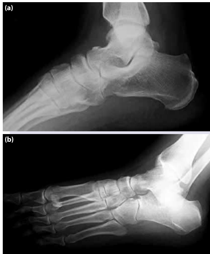
Figure 1. (a) Lateral and (b) oblique foot radiographs of the patient.

tissue swelling subsided gradually, the patient suffered from chronic ankle pain and persistent antalgic gait. On physical examination, there was tenderness over the foot distal and inferior to the anterior talofibular ligament (ATFL). The range of ankle movements was slightly painful and inversion of the ankle produced considerable pain. Neurovascular examination was normal. The initial foot radiographs were available and re-evaluated (Figure 1). [see page 83 for diagnosis]