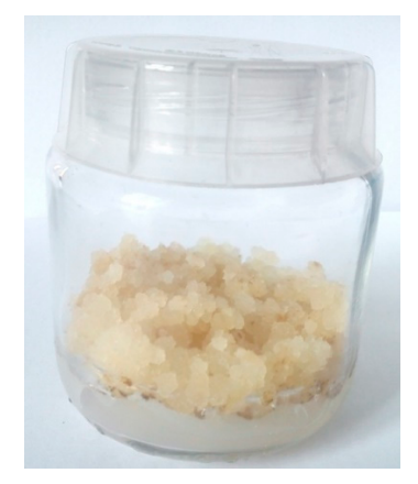
Figure 2. P. coccineus 10-day callus culture.

After seven and 14 days, the pH of the aqueous plant cultures was measured. The cultures to which the flavonoid compound was added had a pH in the range of 4.9–5.1. The callus suspended in water without flavonoids showed a pH above 6. After 14 days, the aqueous callus cultures began to darken and die; their pH increased to about 8. However, cultures with the added flavonoids remained fair, and their pH did not increase. On this basis, it can be concluded that the addition of flavonoid compounds to aqueous plant cultures prolongs their stability, probably due to the antioxidant activity of flavonoids.