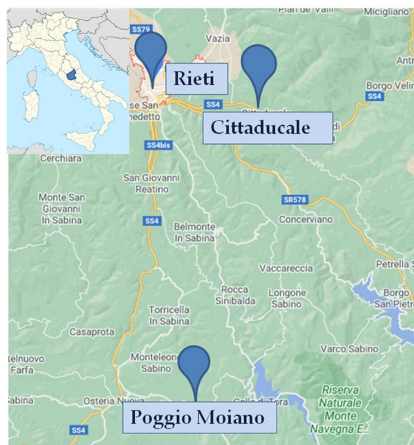
Figure 1. Map of the three sampling sites in the study area (province of Rieti, central Italy).

A cross-sectional study was conducted in June 2018 in Rieti province (Latium, central Italy) (Figure 1). A total of 369 children aged 5–11 years were recruited from primary district schools, as described previously [40].