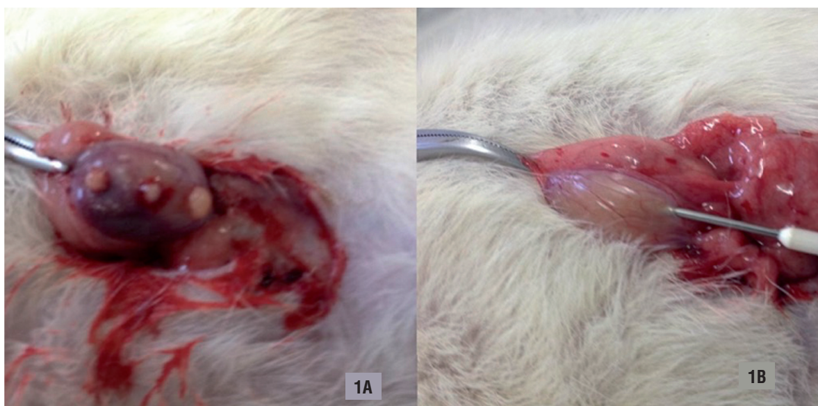
Figure 1 - Testicular sperm retrieval procedure. A) Testicular Sperm Extraction (TESE); B) Testicular Sperm Aspiration (TESA).

The blood collection was conducted after anesthesia by puncturing the retro-orbital venous sinus (12) with a capillary tube. One point five (1.5) milliliters of blood were dripped into the appropriate collector tube containing anticoagulant. The blood was subjected to centrifugation and the obtained serum was frozen and stored until the testosterone dosage was set. The collection was always performed between 8:00 and 10:00 AM. The T measurements were conducted in the Clinical Analysis Laboratory at the same institution. The plasmatic total T measurement was performed through chemiluminescence; the Beckman Coulter (Access 2 Immunoassay System/Albalab Biosystems NE/California, USA) was used in the procedure. The device was calibrated using the kit provided by the manufacturer before the analysis. All samples were assessed in duplicate and the results were expressed in nanograms per milliliter (ng/mL).