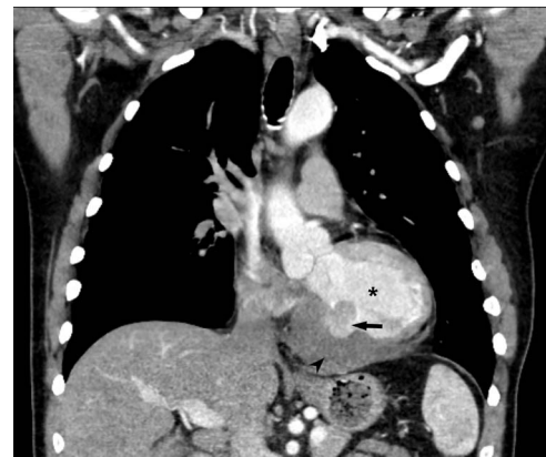
Figure 1. Coronal CT demonstrating left ventricular wall defect and intrapericardial thrombus; asterisk = left ventricular cavity, arrow = left ventricle free wall defect, arrowhead = thrombus.

He returned 5 weeks later complaining of 72 hours of malaise, fevers and chest pressure. He was tachycardic and hypotensive but intermittently responsive to fluid