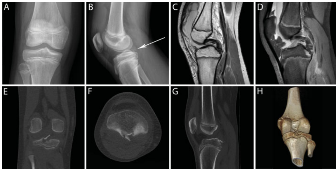
Fig. 1 (A) Anteroposterior and (B) lateral radiograph of the right knee, showing prepatellar intra-articular effusion and isolated avulsion fracture with elevation of the tibial attachment of the posterior cruciate ligament (arrow). (C) Sagittal T2- and (D) T1-weighted magnetic resonance imaging sequences showing gross knee effusion, the avulsion fracture and no posterior cruciate ligament injuries. (E) Coronal, (F) axial, (G) sagittal, and (H) 3D reconstruction computed tomographic images showing fracture of the tibial attachment of the posterior ligament with dislocated tibial fragment measuring 11 \times 4 mm and presenting a maximal displacement of 7 mm. 3D, three-dimensional.

intra-articular effusion and an isolated avulsion fracture with the elevation of the tibial attachment of the PCL ( Fig. 1A, B ). The diagnosis was subsequently confirmed by computed tomographic scanning, and other bone lesions were excluded ( Fig. 1E-H ). The tibial fragment measured 11 \times 4 mm and presented a maximal displacement of 7 mm. No other ligamentous, meniscal, or chondral injuries were observed in a magnetic resonance imaging examination ( Fig. 1C, D ). Because of minimal displacement, we decided to treat the avulsion fracture in a conservative way. The knee was immobilized for 6 weeks, with a long leg cast with 30 degrees of knee flexion. The patient was asked to walk with crutches, avoiding weight bearing. After removing the cast, the patient was allowed to begin gentle range-of-motion activities and weight bearing. The patient was asked to report for regular clinical and radiological controls every 4 to 6 weeks until 3 months after the trauma. No pain or instability was detected during a physical examination, and magnetic resonance imaging showed progressive consolidation of the fracture over time. Subsequently, the patient was allowed to progressively return to sport activities, reporting only rare episodes of knee joint swelling and slight pain during severe exertion. In addition, the patient was asked to fill in the functional knee score of Tegner and Lysholm (1985). 5 With a result of 90/100, the outcome was evaluated as good.