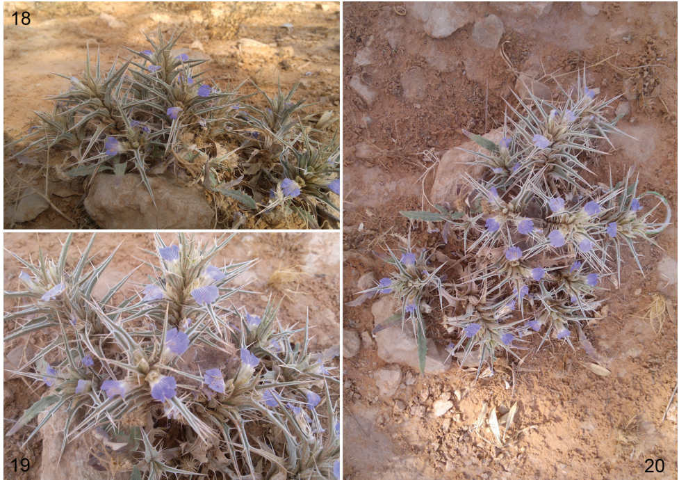
Figures 18–20. Photographs of Blepharis ciliaris (L.) (Acanthaceae) in Saudi Arabia. 18 Entire plant in lateral view 19 Detail of flowers 20 Entire plant as viewed from above.

Host plant. The species was captured visiting flowers of Blepharis ciliaris (L.) (Acanthaceae), locally known as “Saha” or “Naqie” (Figs 18–20). The plant is a perennial herb, usually about 20 cm in height (10–30 cm), growing in small patches with small blue to light violet flowers and easily found in the area of Al Amariah, approximately 25 km northwest of Riyadh, from early April through early June. The species prefers the silt bottoms of rocky wadi basins. Blepharis ciliaris is a good source of nectar, particularly in the southwest and in years following a good rainy season. Regional beekeepers sometimes produce “Saha honey”.