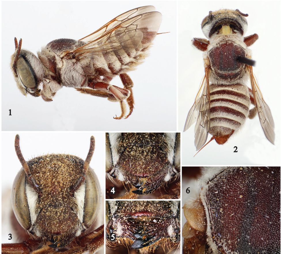
Figures 1–6. Photomicrographs of female holotype (KSMA) of Chaligidoma (Pseudomegachile) riyadhense sp. n. 1 Lateral habitus 2 Dorsal habitus 3 Facial view 4 Detail of clypeus 5 Detail of mandibles 6 Detail of mesoscutal integument.

modified facial setae; and clypeus with distal margin distinctly impunctate and swollen medially (Figs 4, 5). In addition to the body coloration and pubescence (Figs 7, 8), which are similar to those of the female, the male can be recognized by the following combination of characters: clypeus distinctly pointed on distal margin (Fig. 10); mandible without inferior process; tarsi of all legs unmodified but with small dark spot on inner surface of probasitarsus; sixth metasomal tergum horizontal in profile, and seventh tergum with strong, transverse preapical carina deeply notched medially (Fig. 12).