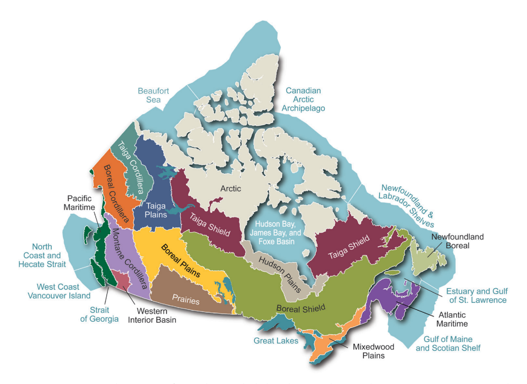
Figure 1. Terrestrial ecozones of Canada as included in the Canadian Biodiversity Ecosystem Status and Trends 2010 report (Federal, Provincial, and Territorial Governments of Canada 2010). [Reprinted with permission from Environment and Climate Change Canada]