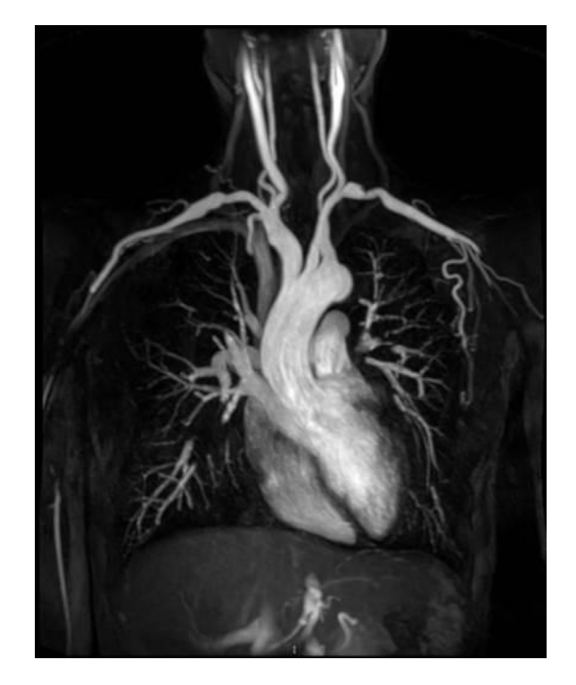
Fig 1. Bilateral subclavian artery stenosis. Coronal reconstruction of magnetic resonance angiogram shows noncalcified stenosis of bilateral subclavian arteries suggestive of Takayasu arteritis.

paravisceral aorta extending through her aortic bifurcation with severe stenosis of her common iliac arteries. Her erythrocyte sedimentation rate and C-reactive protein level were within normal limits. She had normal renal function, and parathyroid hormone levels were also within normal limits, ruling out primary hyperparathyroidism. She fulfilled four of the six 1990 American College of Rheumatology classification criteria for Takayasu arteritis<sup>1</sup> (present: age <40 years, claudication, aortic bruit, angiographic abnormalities; absent: decreased brachial pulse, systolic difference >10 mm Hg between arms). The clinical impression was that her claudication was secondary to fibrotic stenoses from previously active Takayasu arteritis, and the patient was continued on azathioprine as a remission maintenance agent.