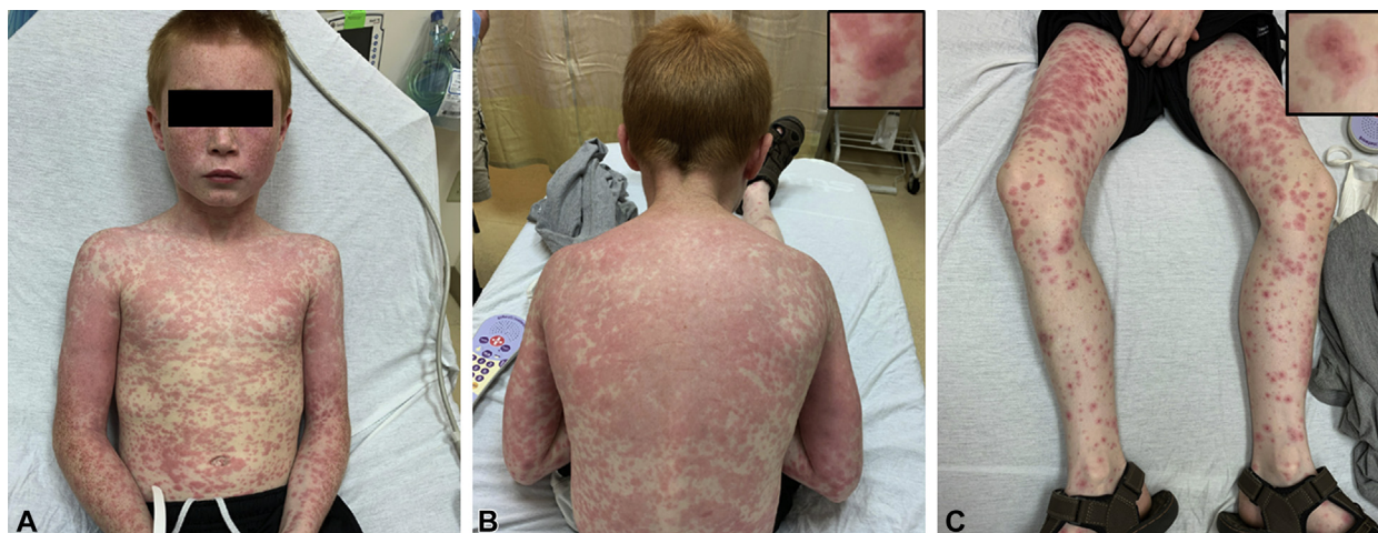
Fig 1. Clinical appearance of urticaria multiforme-like drug eruption in our patient, who was taking the novel cystic fibrosis agent elexacaftor/tezacaftor/ivacaftor. Numerous pink-to-erythematous, edematous papules and plaques on (A) the chest, trunk, and bilateral anterior upper extremities; (B) the back and bilateral posterior upper extremities, which displayed numerous targetoid lesions ( inset ); and (C) the bilateral anterior lower extremities, which also displayed numerous targetoid lesions ( inset ).