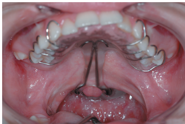
Figure 2- Intraoral speech bulb