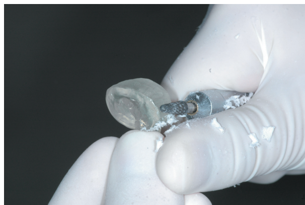
Figure 3- Pharyngeal obturator reduction with bur – phase of fray

displacement of velopharyngeal structures was established and verified by the lack of ability of the child to avoid nasal air leak. About 6 mm of acrylic was removed from the bulb surface once the reduction program was finished (Figures 3, 4, 5 and 6).