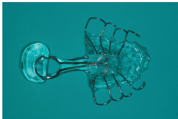
Figure 1- Pharyngeal obturator (speech bulb)

The first two phases targeted adequate production of oral place of articulation of high pressure speech sounds. Strategies involved manipulation of oral and nasal air pressure and airflow while establishing adequate place and manner of speech sounds as proposed by Golding-Kushner 2 (2001) and Bzoch 1 (2004). Visual, auditory and tactile feedback was used to contrast the target to the inadequate productions. The target was initially established in isolation followed by syllable production. Once the