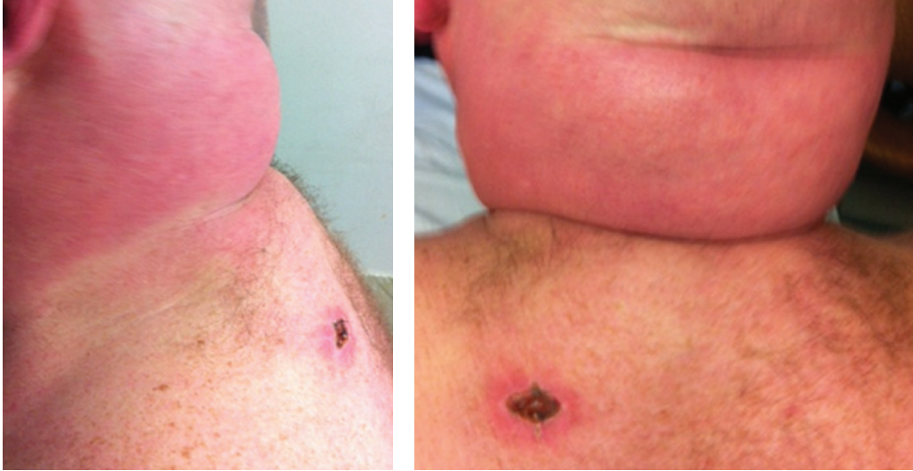
FIGURE 1: Nonpitting and thickened skin on upper back and nuchal area.