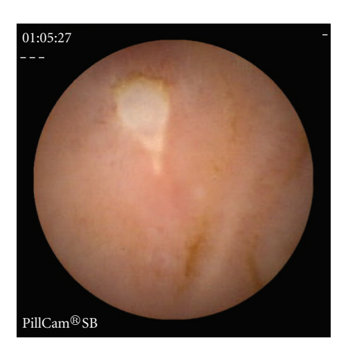
FIGURE 1: Jejunal ulcer.