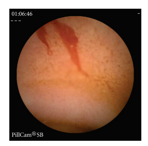
FIGURE 2: Bleeding jejunal ulcer.

of complaints to the date of SBCE, endoscopic findings, complications associated with the examination, clinical assessment during the follow-up period, and duration of the same. Patents for whom there were references in the medical files to the use of NSAIDs during the month prior to the examination and patients with a follow-up period of less than six months after the date of the examination were excluded from the study.