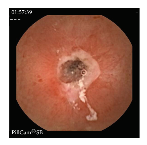
FIGURE 4: Jejunal ulcerated stenosis.