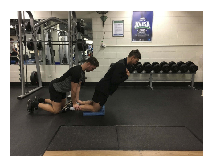
Figure I The Nordic hamstring exercise is commonly executed with a partner who secures the ankles, to allow the participant to lower as far as possible to the floor, before the participant use hands to reach the floor in the final stage.

movement involves eccentric contraction of the hamstrings muscle using a reverse origin-insertion motion. The attraction of NHE is that no equipment is required, making it widely accessible. This review explores the evidence associated with the use of NHE in Australian Rules Football (ARF).