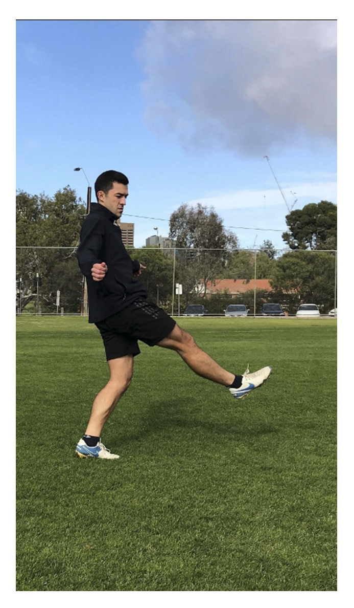
Figure 2 Example of typical degree of hip flexion and knee extension in a soccer kick.

Performance of NHE has been shown to have a number of effects on muscle performance and architecture. The NHE elicits changes in muscle performance and mid-range torque dynamics which could be effective in reducing hamstring injuries. For example, Mjolsnes et al<sup>24</sup> reported an 11% increase in eccentric torque of the hamstrings (p<0.01) after 10 weeks of NHE training in well-trained