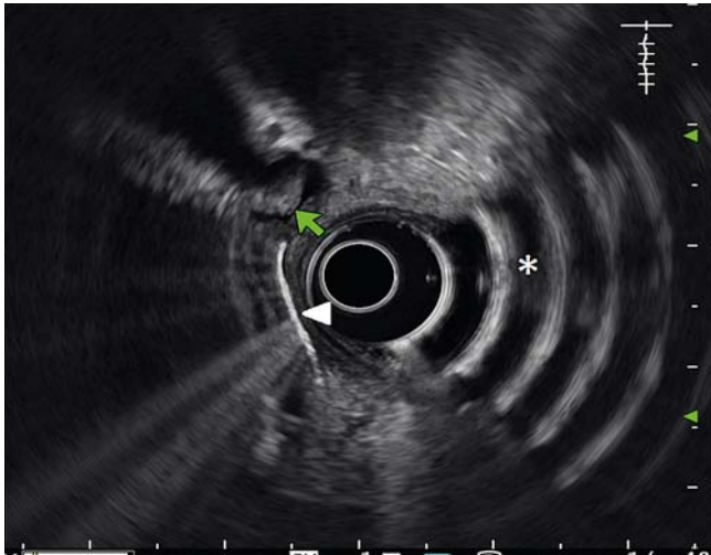
► Fig. 1 Typical image showing visual artifacts from the second portion of the duodenum (asterisk). The image also shows a stone (green arrow) and aerobilia (arrowhead) in the common bile duct.