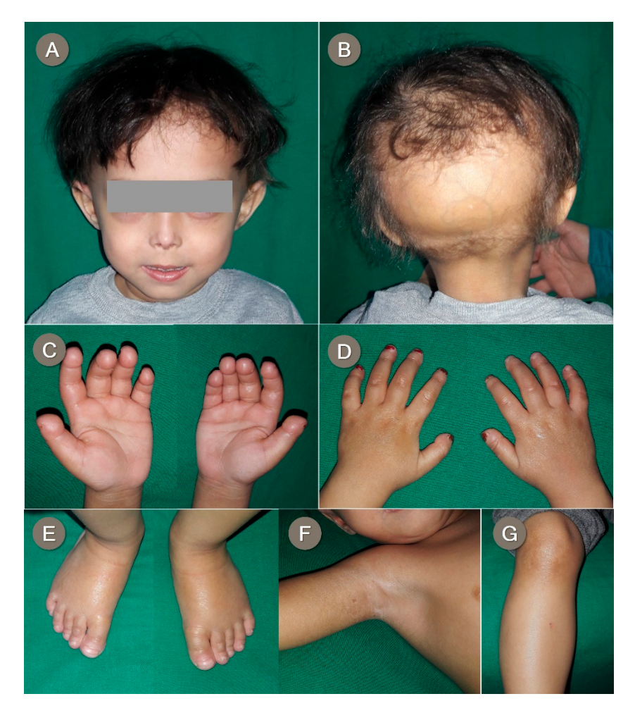
Figure 3. Proband 3 shows a receding anterior hairline; scanty scalp hair; bulbous cheeks with visible veins; wide eyes with periocular hyperpigmentation; a pointed nose; a small mouth and micrognathia ( A ); occipital alopecia and prominent scalp veins ( B ); round-tipped terminal phalanges of fingers ( C ); atrophic shiny skin on the dorsum of hands and broad, short, dystrophic nails ( D ); mild rounding of toe tips and broad, short nails ( E ); hyperpigmented thin skin over knees ( F ); and hyper- and hypopigmented patches on axilla ( G ).

On physical examination, we noticed a receding anterior hairline, scanty scalp hair, total occipital alopecia, and prominent scalp veins (Figure 3B). In addition, the patient had an oval face, bulbous cheeks with visible veins, wide eyes, periocular hyperpigmentation, a tapered nasal tip, a small mouth, dental crowding, mandibular hypoplasia, and microretrognathia (Figure 3A). He also presented with round-tipped terminal phalanges of the fingers and toes with broad, hypoplastic nails (Figure 3C–E). In addition, hard shiny skin on the dorsum of the hands with subcutaneous nodules on the knuckles, pigmentary changes on the knees, and hypopigmented patches on the axilla were noted (Figure 3F,G). Similar to the other two probands, both weight and height were lower than the third centiles, while the head circumference was within the normal range for his age (weight: 9.5 kg, height: 78 cm, head circumference: 49 cm). On reviewing the chest radiograph, there was no evident clavicular osteolysis or dysplasia, only mild thinning bilaterally.