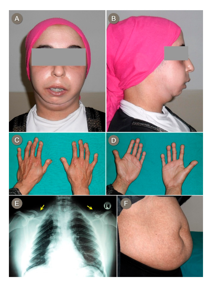
Figure 1. Proband 1 shows an oval-shaped, bird-like face; wide prominent eyes; full cheeks; submental obesity; arched, heavy eyebrows; a narrow, prominent nasal bridge and shallow philtrum ( A ); a beaked nose and severe mandibular hypoplasia ( B ); bulbous fingertips and nail dystrophy ( C , D ); marked bilateral clavicular hypoplasia evident on chest X-ray ( E ); and marked abdominal obesity and reticular/mottled hyperpigmentation ( F ).

A 27-year-old woman, born to Egyptian consanguineous healthy parents, was referred for genetic assessment for her progressive condition of mandibular hypoplasia (Figure 1A,B), lipodystrophy of extremities, loss of scalp hair, and skin hyperpigmentation. The condition started at around the age of 14 years. The patient was born at term after an uneventful pregnancy, with normal growth parameters. All through her childhood, she had average physical growth, normal psychomotor development, and good scholastic performance. Notably, the patient underwent a number of unsuccessful plastic surgeries in an attempt to reverse the mandibular changes.