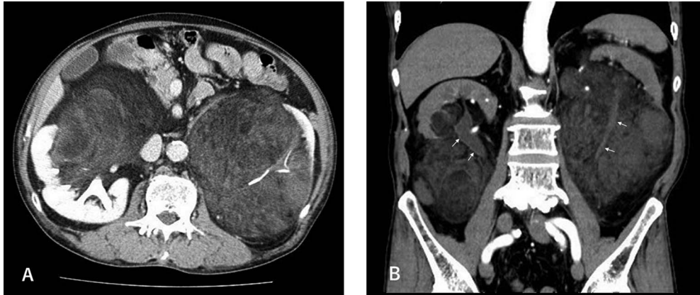
Figure 1: (A) Axial enhanced CT image showing bilateral giant masses arising at the renal sinuses; (B) sagittal enhanced CT image showing masses displacing the kidneys superolaterally and lack of dilatation of the pelvis or ureter (arrow).