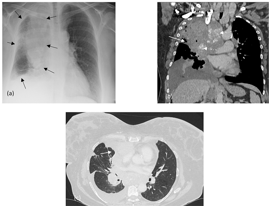
FIGURE 1: Chest radiographs

(a): Circumferential pleural thickening of the right lung (within black arrows) with decreased lung volume. CT chest with contrast (b) and (c): nodular pleural thickening that encases the right lung with extension onto the mediastinal pleura (white solid arrows) and into the fissures. Large calcified pathologically enlarged mediastinal and hilar lymph nodes (white dashed arrows) are seen.