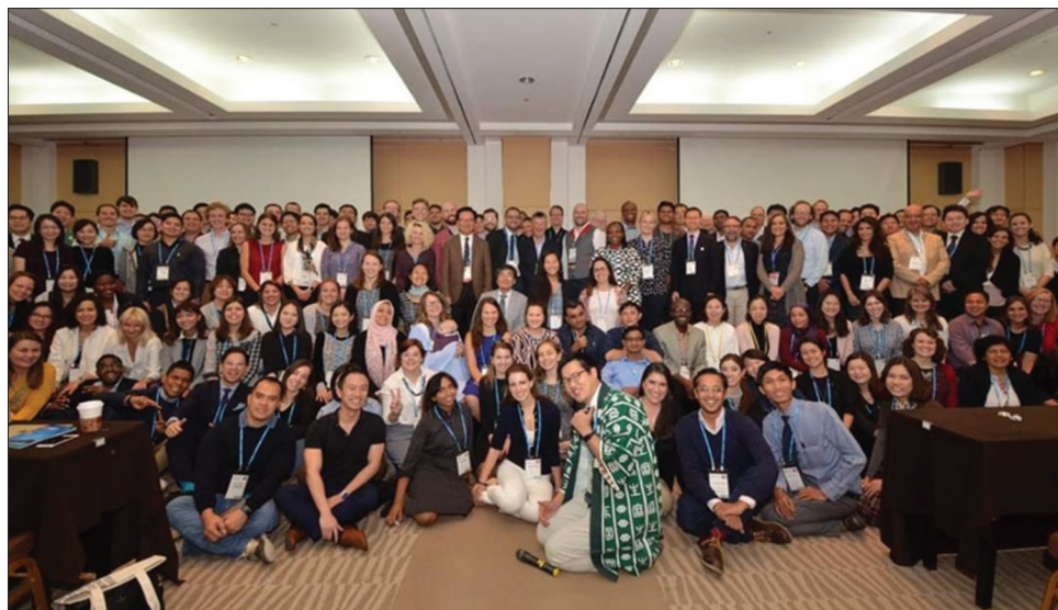
Figure 2: Global Young Doctors Meeting in during the 22 nd WONCA World Conference of Family Doctors