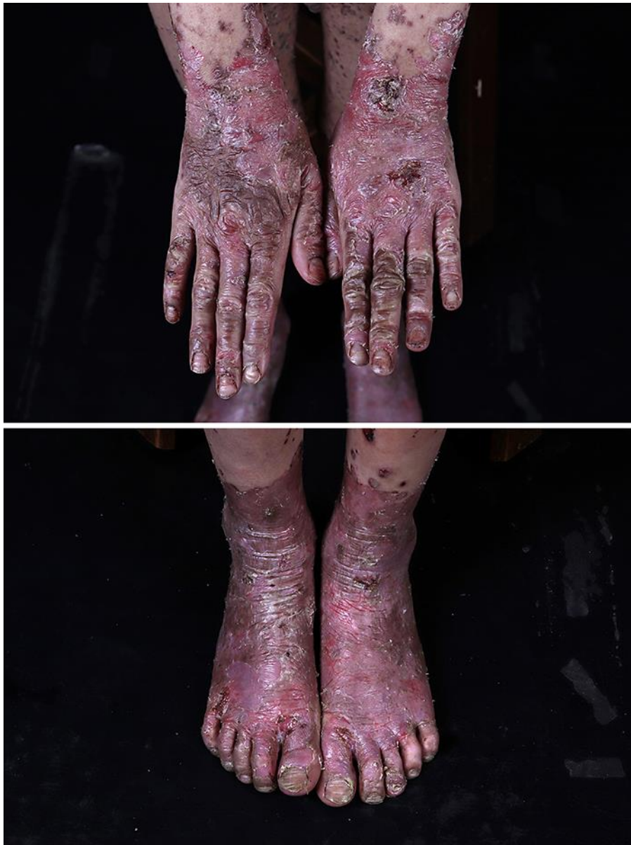
Fig. 3. Opaque change of all finger and toe nails with multiple Beau lines and perionychia.