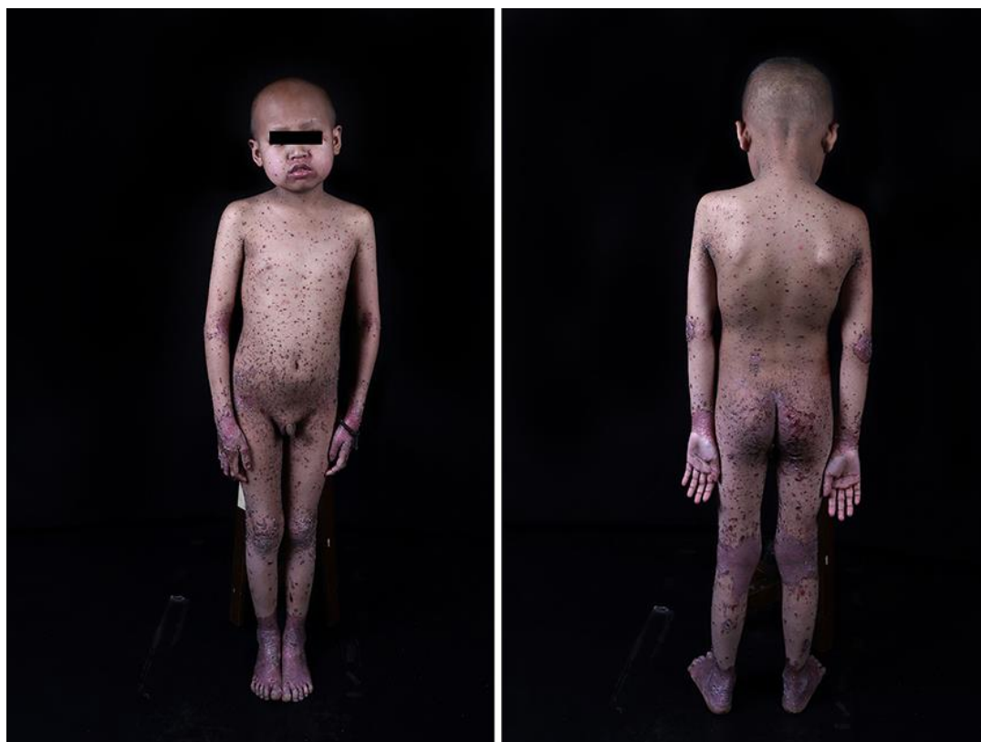
Fig. 2. Erythematous vesicles with erosion and some covered with hemorrhagic crusts in almost the entire body. Acute and chronic eczematous changes can be observed mainly in the flexural aspects of the extremities, typical of AD.